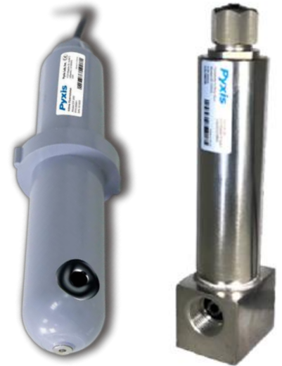
HM-500 & HM-500SS Series Oil In Water Sensors

The Pyxis HM-500 series inline fluorometer sensors measure the concentration of oil in water read as ppm Marine Crude-Offshore Oil. The sensors utilize an LED sourced UV-fluorescence methodology at 365nm wavelength and 410/470nm excitation. Pyxis HM-500 series sensors are uniquely designed with extra photo-electric components that also monitor the color and turbidity of the sample water. This proprietary feature enables the HM-500 series to automatically compensate for color and turbidity in the water sample eliminating interferences commonly associated with real-world waters, up to 150NTU. The Pyxis HM-500 series inline sensors have a short fluidic channel and can be easily cleaned. The fluidic and optical arrangement of the HM-500 series are designed to overcome shortcomings associated with other fluorometers that have a distal sensor surface or a long, narrow fluidic cell. Traditional inline fluorometers are susceptible to color/turbidity interference and fouling and can also be very difficult to clean. These unique features provide HM-500 series with a level of accuracy far greater than conventional inline oil in water sensors and enable users to conduct wireless inline sensor cleanliness diagnostics as a predictive measure via the uPyxis APP for mobile and desktop devices.