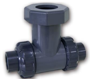
ST-001 Inline Tee for CPVC Installations